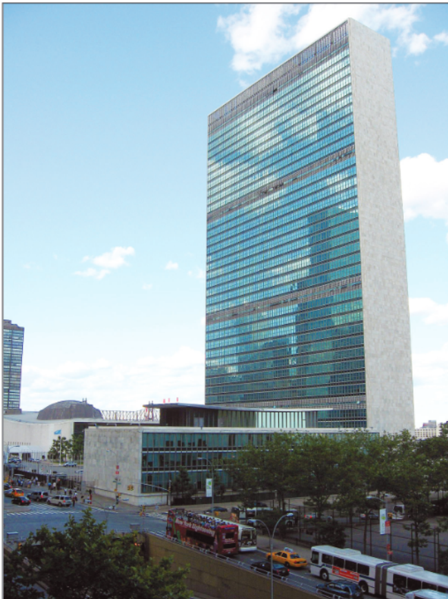
◀ Headquarters of the United Nations in New York City, USA.

Agenda 21 (explained below) is being carried out by NGOs. For example, the New Israel Fund (funded by the Ford Foundation and others) as well as such groups as George Soros' Open Society Foundations and Oxfam. The intention, I surmise, is to destroy Israel from within like other Western countries.